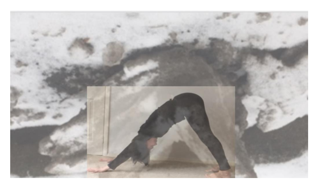
Ardho Mukha Svanasana (Downward Facing Dog) with piece of ice