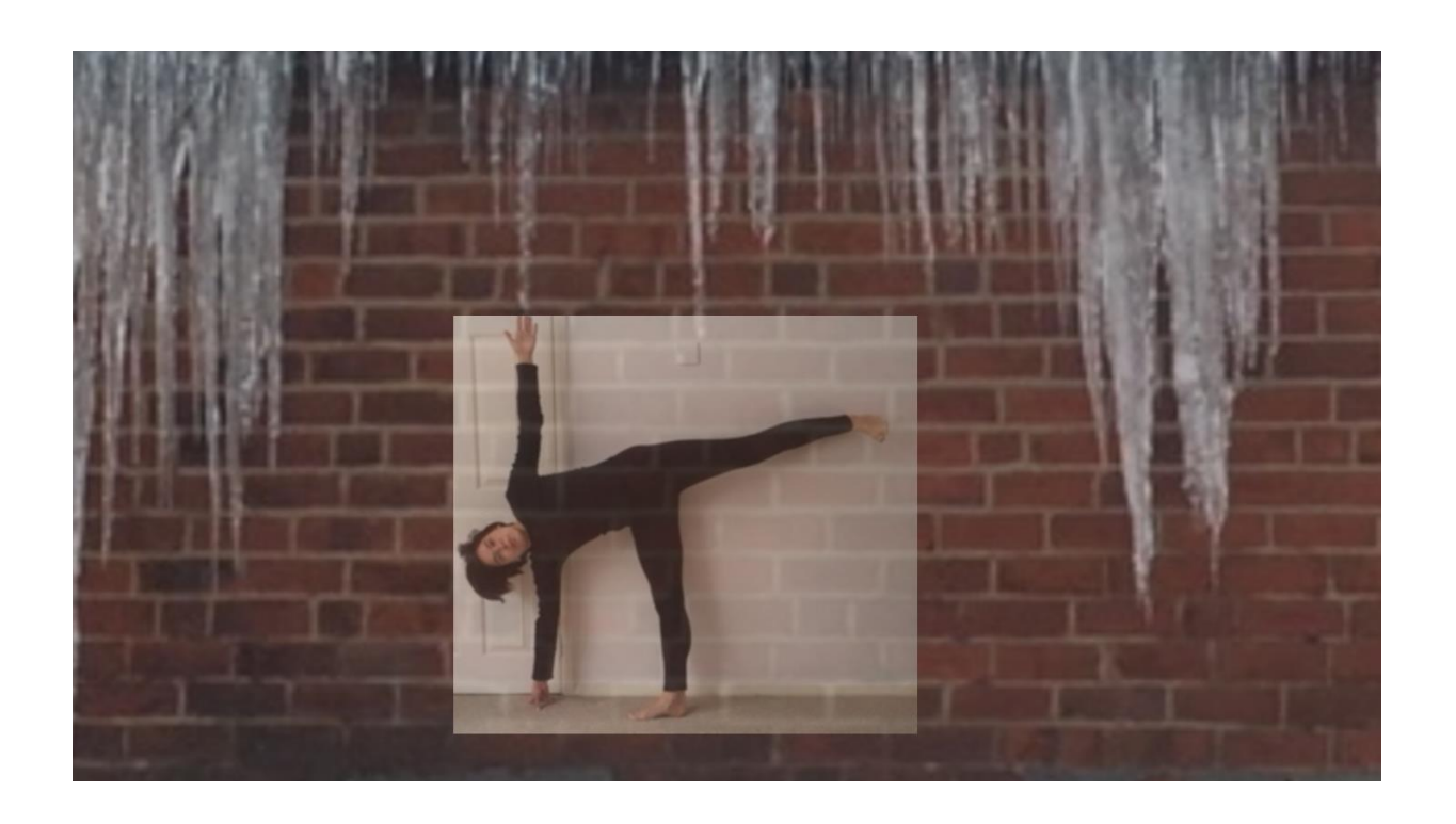
Arda Chadrasana (Half Moon Pose) with Icicles