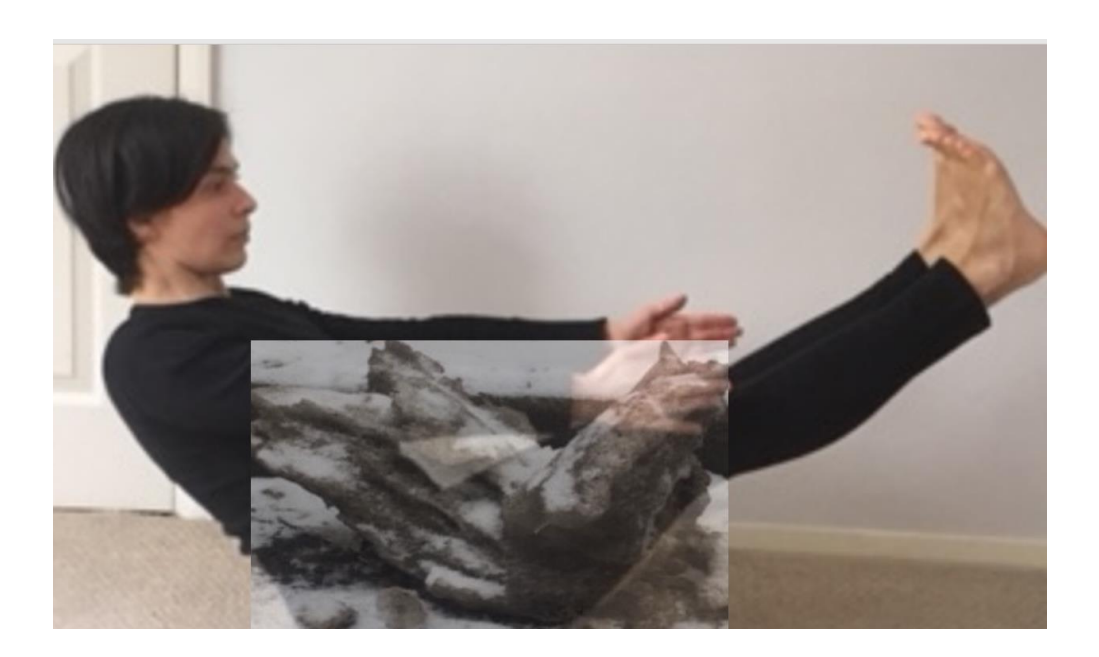
Navasana (Boat pose) with piece of ice